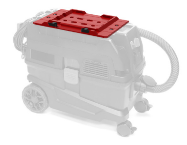
SHELVE ADAPTER PLATE CAN BE COMBINED WITH COUNTLESS OTHER DEVICES.