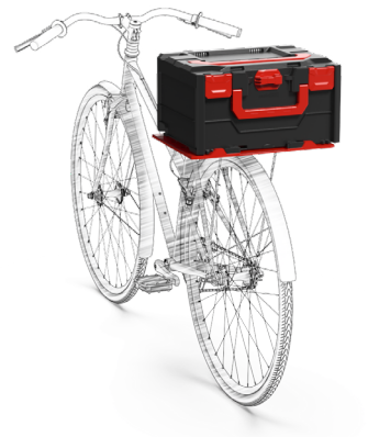
METABOX CASE ON YOUR BICYCLE