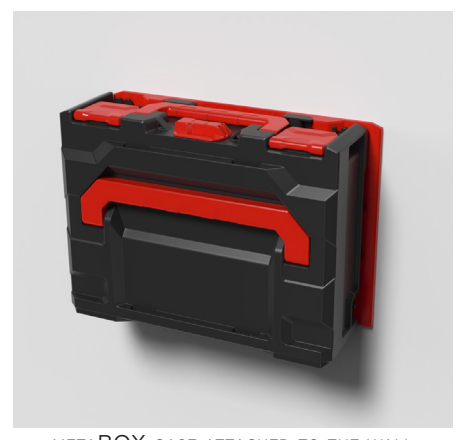
METABOX CASE ATTACHED TO THE WALL