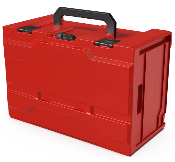
metaBOX 300XL External dimensions: 596 x 396 x 300 mm Inner dimensions: 577 x 362 x 262 mm Weight: 4,5 kg