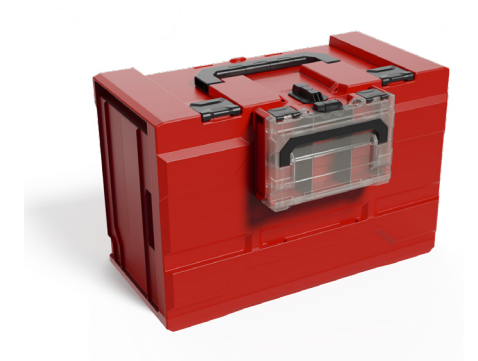
METABOX 63XS CONNECTS AS WELL TO THE METABOX 300XL CASE