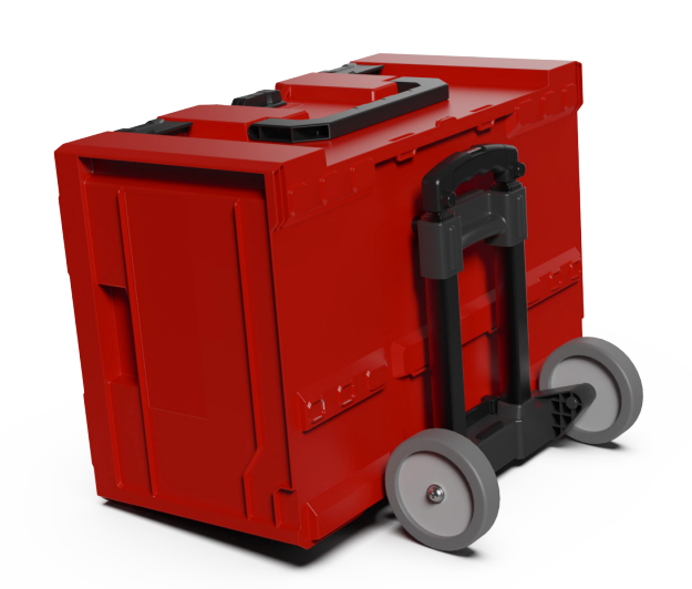
"Standard" \underline{\text{Trolley 34725 B}} (from Adam Hall Hardware) can be simply attached (and removed) from the metaBOX 300XL.