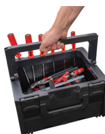
CARRIES UP TO 25KG