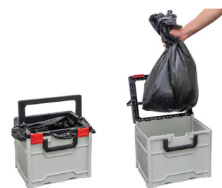
VERSATILE AND FLEXIBLE TO USE