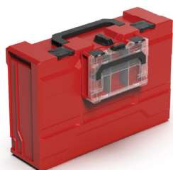
META BOX 63XS CONNECTS AS WELL TO THE META BOX 185XL CASE