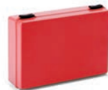
PLASTON B3 Inner dimension: 289 x 191 x 80 mm Weight: 0.55 kg