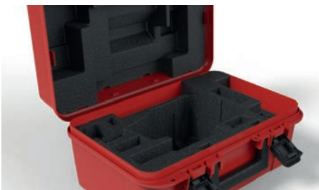
EPP insert in the lid and case