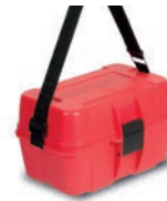
PLASTON C35 Inner dimension (Centre): 296 x 183 x 175 mm Inner dimension (Base): 270 x 158 x 175 mm Weight: 0.81 kg