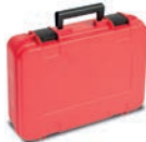
PLASTON C54 Inner dimension (Centre): 446 x 313 x 110 mm Inner dimension (Base): 438 x 295 x 110 mm Weight: 1.49 kg