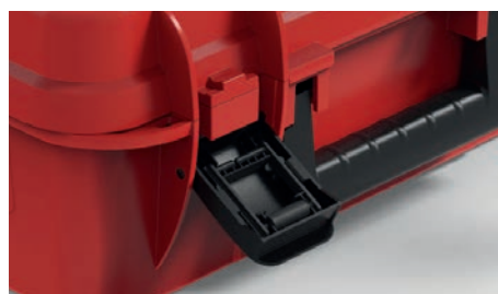
Plaston Soft-Click latch