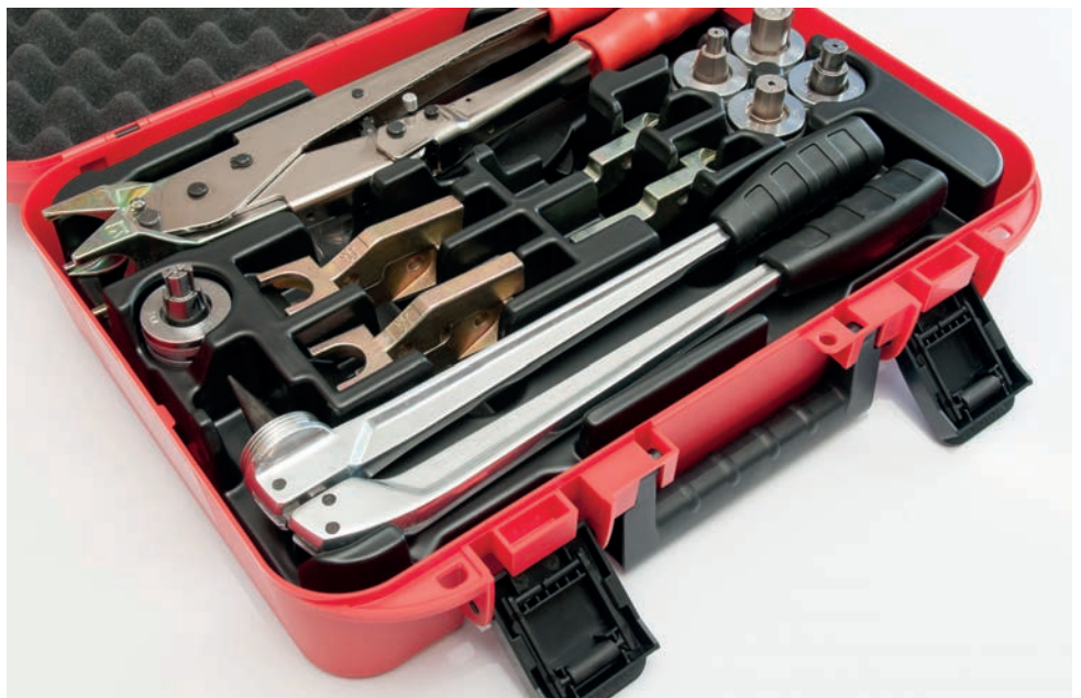
Assembled C54 Plaston case with thermoformed insert and waved foam