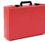
PLASTON T126 Inner dimension: 530 x 375 x 130 mm Weight: 2.42 kg