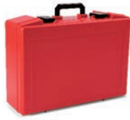
PLASTON T156 Inner dimension: 609 x 409 x 201 mm Weight: 4.08 kg