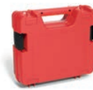
PLASTON C40 Inner dimension (Centre): 236/285 x 197 x 86 mm Inner dimension (Base): 231/277 x 190 x 86 mm Weight: 0.65 kg