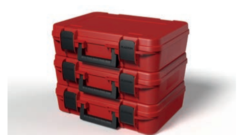
Cases can be stacked and are suitable for pallets