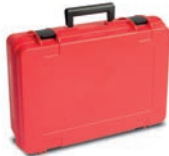
PLASTON C120 Inner dimension (Centre): 571 x 393 x 160 mm Inner dimension (Base): 561 x 382 x 160 mm Weight: 3.08 kg