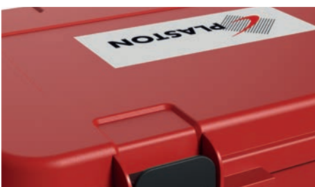
Customized print on the lid and base